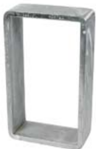
S 6x1 AISI 316 S006000000121

S-kehukset, haponkestävä ruostumaton teräs / Рама S, кислотоустойчивая, стальная / S-ramar, syrafast rostfritt stål / Telaio S, in acciaio inox resistente agli acidi